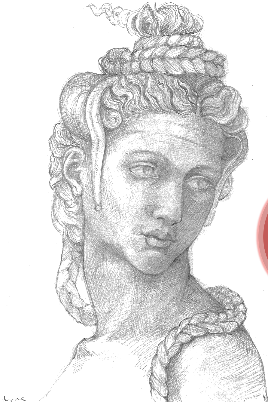
Artwork by Class 9 student, Sabine Dawson. A drawn copy of Michelangelo's black chalk drawing of Cleopatra.